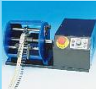
MOT98 - 7915030 - 220 V. - MOTOR DRIVE UNIT. MOT98 - 7915031 - 110 V. - MOTOR DRIVE UNIT