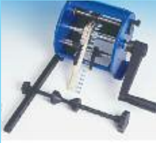
BR6 - 400200 TAPE REEL HOLDER