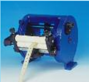
TNS - 21.0011 WASTE TAPE ROLLERS