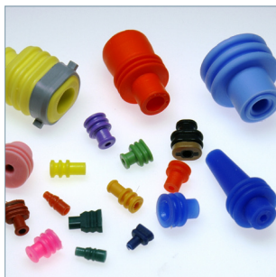
Wide range of seal types