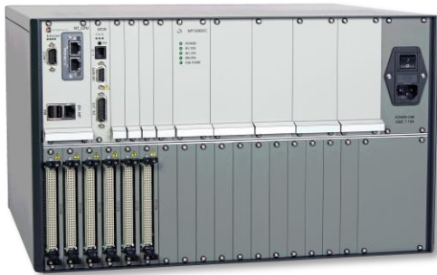
Image: KT 630 with options