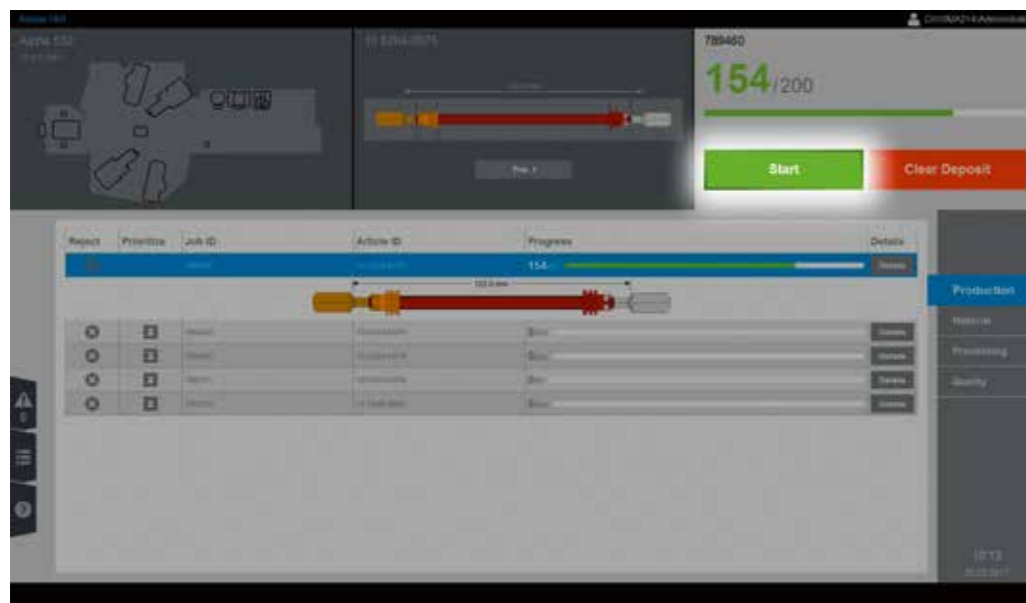
The Green Button guides the user easily from the job list to the material changeover page, and from the verification sequence to production, until the job is completed.